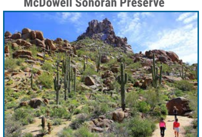
1) Pinnacle Peak Park