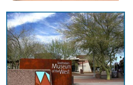
(12) Scottsdale's Museum of the West