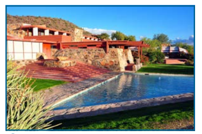
(6) Taliesin West