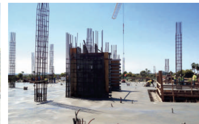
Figure 4: Optima Sonoran Village construction.