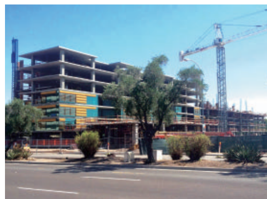
Figure 2: Optima Sonoran Village, Phase I.