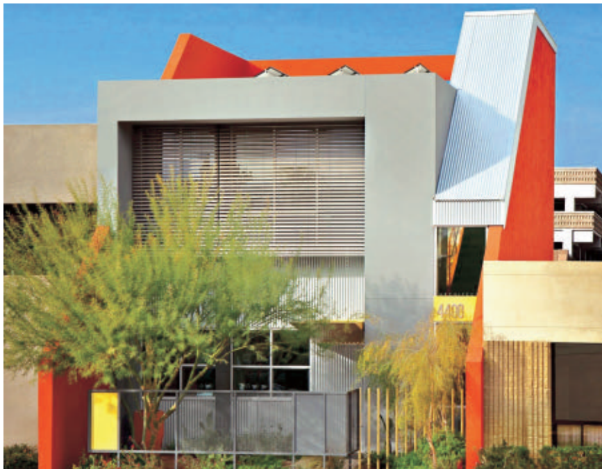
Figure 5: Douglas Architecture Office.