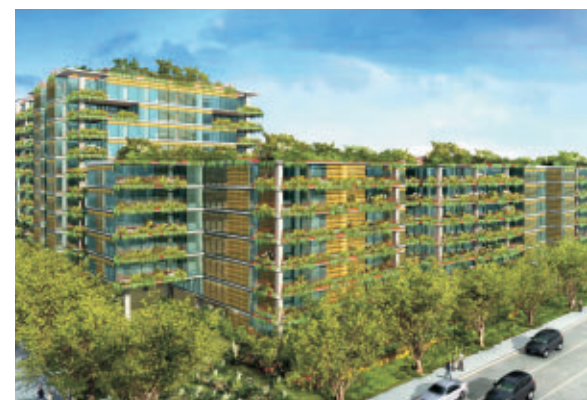
Figure 3: Optima Sonoran Village rendering.