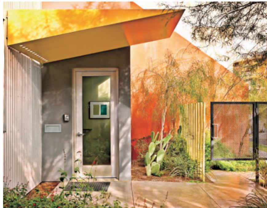
Figure 6: Douglas Architecture Office drought-tolerant landscape.