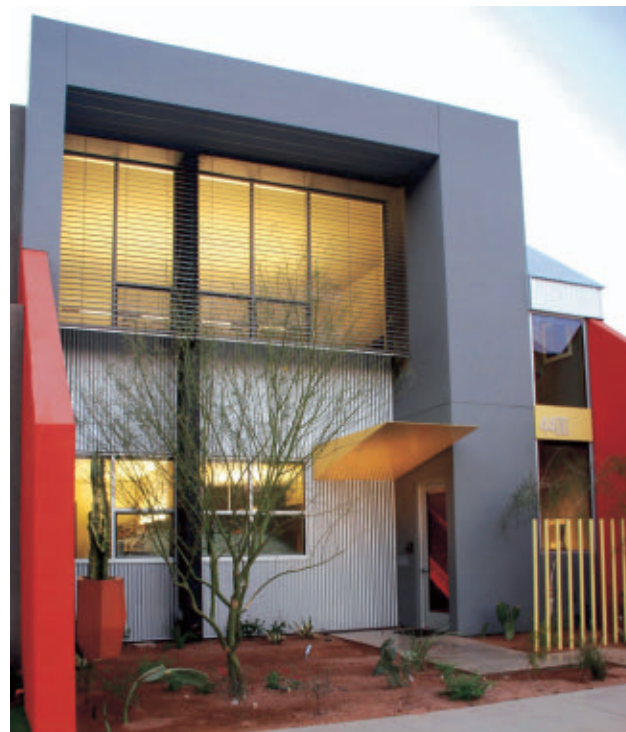
Figure 8: Douglas Architecture Office shading and daylighting.

The project initially was submitted and certified under Scottsdale’s commercial Green Building Program. With funding from the city awarded through an Energy Efficiency and Conservation Block Grant, the Douglas Architecture Office was able to receive a post-occupancy performance evaluation. The assessment was used to help certify the building under the IgCC.