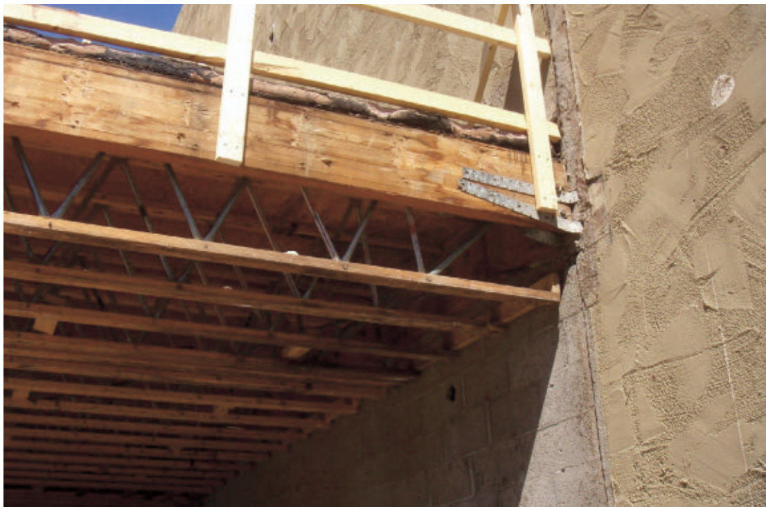
Figure 7: Douglas Architecture Office reconstruction.