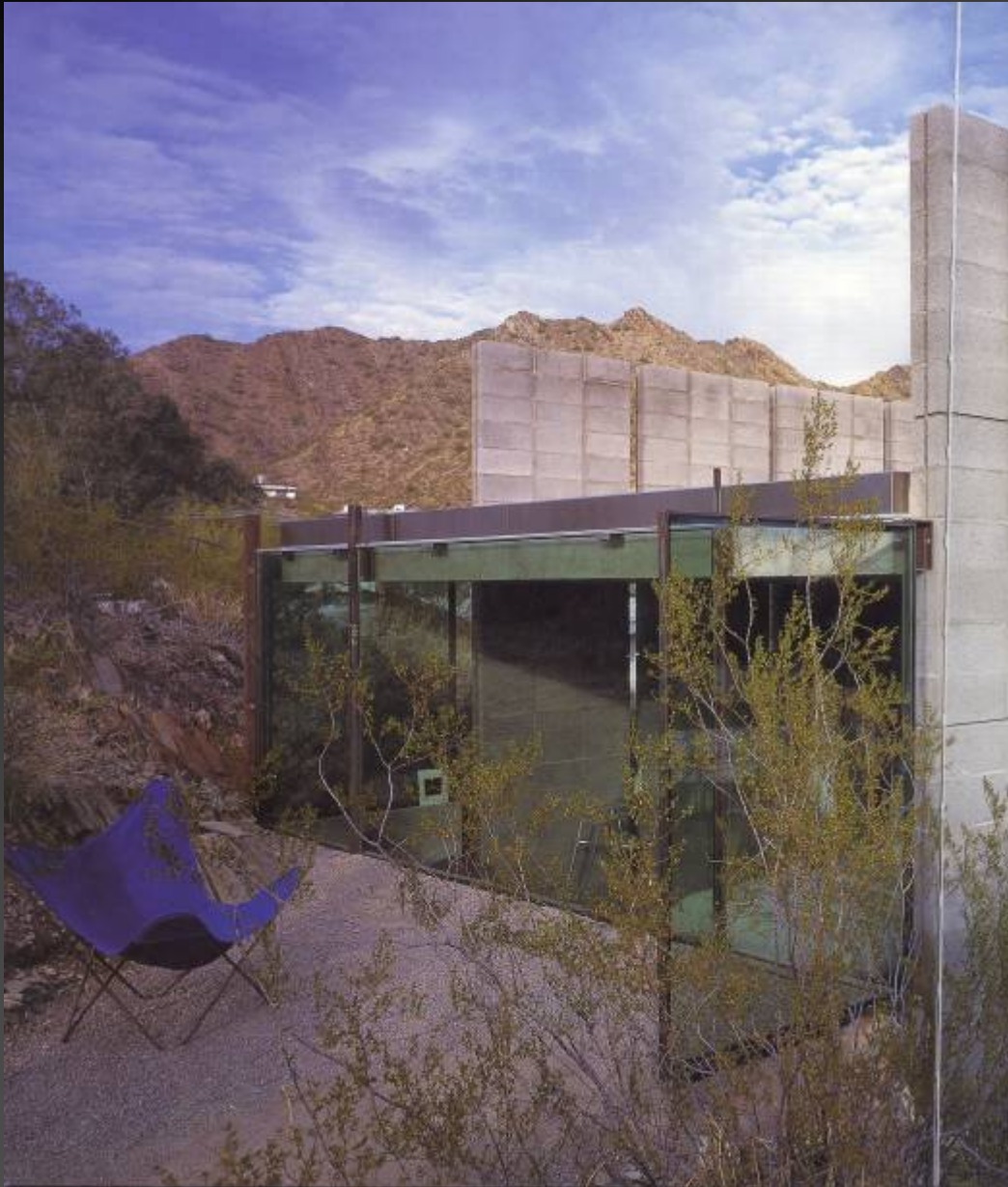
Recessed North facade Burnette House Wendell Burnette Architect