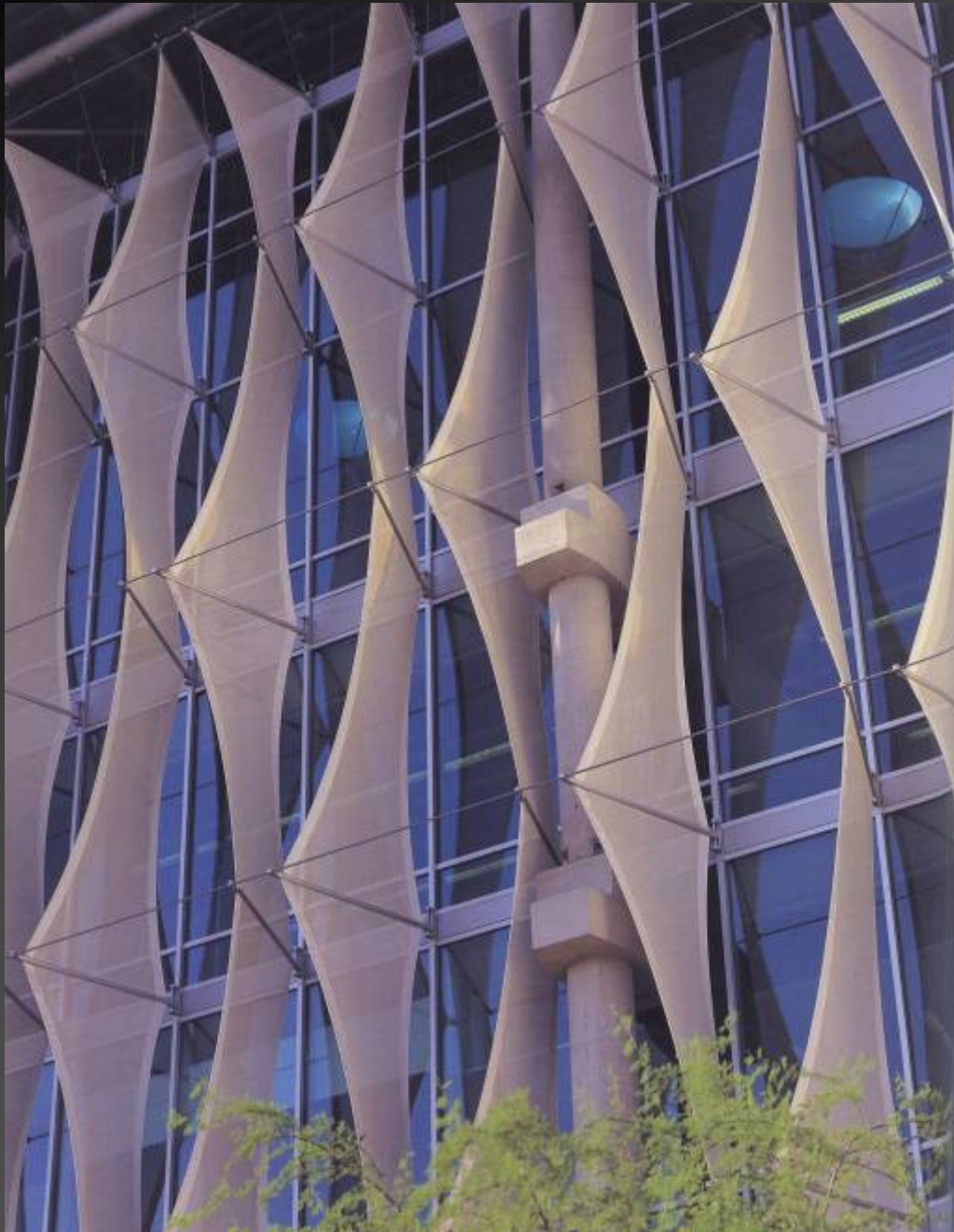
North facade Phoenix Central Library Will Bruder Architects