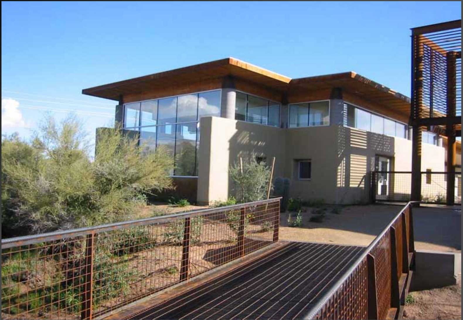
North Elevation at Foothills Academy