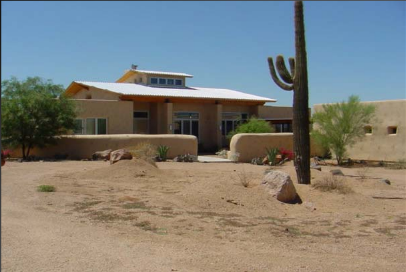
North Elevation at Wolf Environmental House