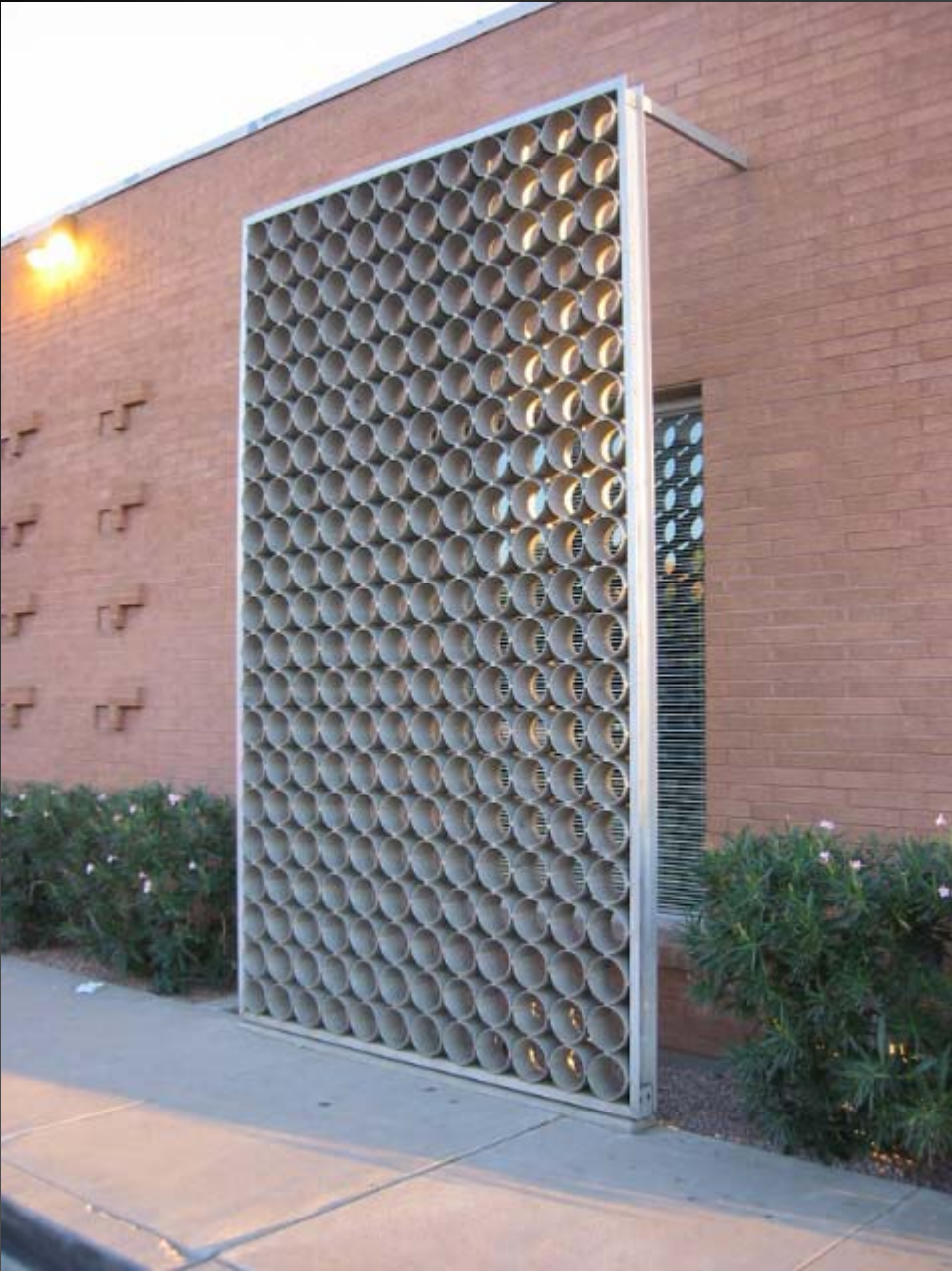
North Elevation at Bank One Phoenix