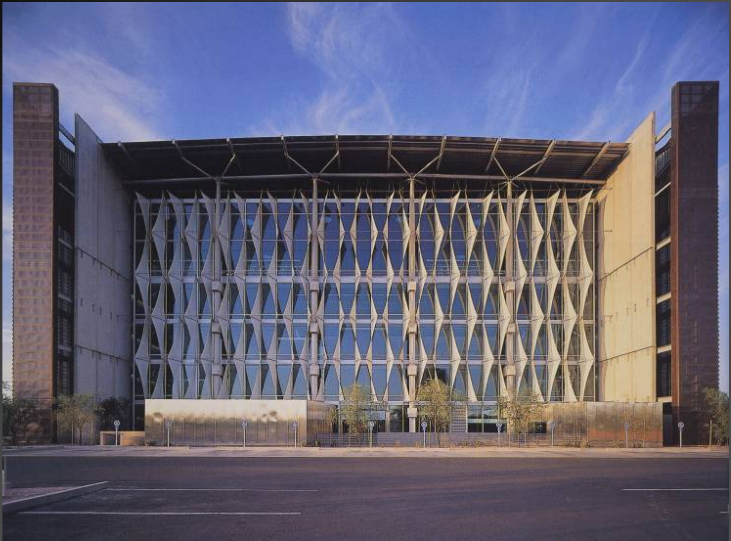
North facade, Phoenix Central Library Will Bruder Architects