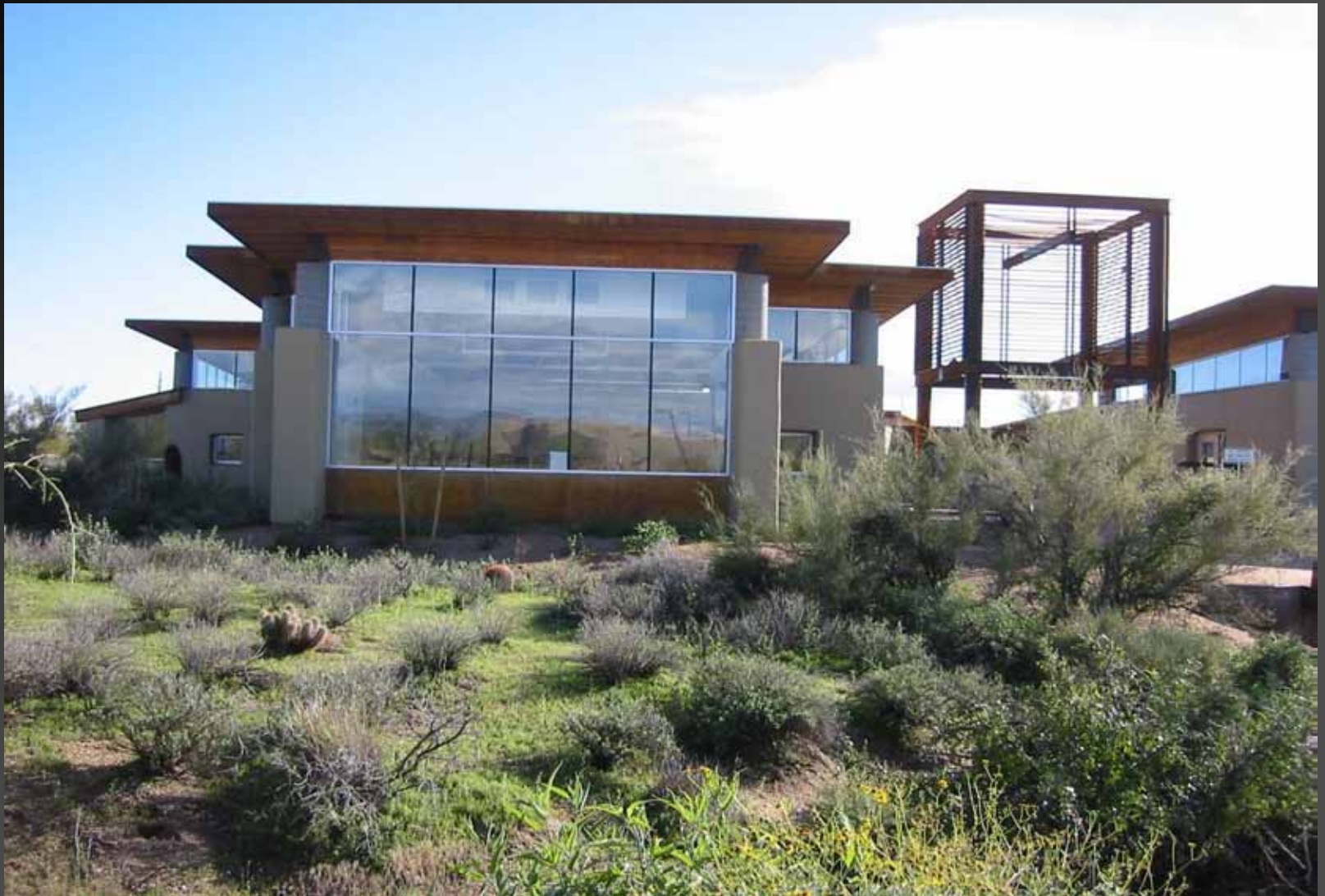
North Elevation at Foothills Academy