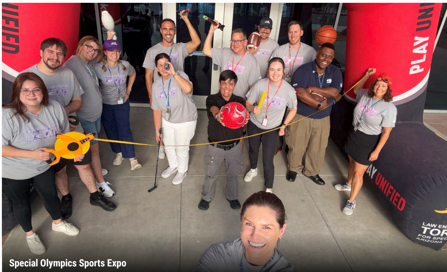
Special Olympics Sports Expo

Note: You must purchase additional life insurance on yourself to be eligible to purchase coverage for your spouse and/or your children. Coverage is subject to the approval of NY Life Insurance. You may apply for new or increased coverage at any time, but you must satisfy NY Life Insurance's insurability requirement.