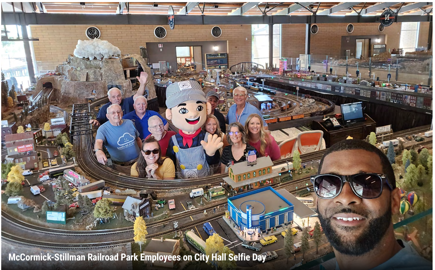
McCormick-Stillman Railroad Park Employees on City Hall Selfie Day

Make sure to check out more resources and discounts under myCigna.com under Perks & Programs.