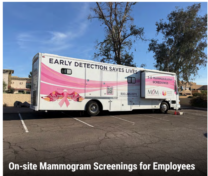
On-site Mammogram Screenings for Employees

* Maximum city contribution is $1,000 per family if both spouses are city employees.