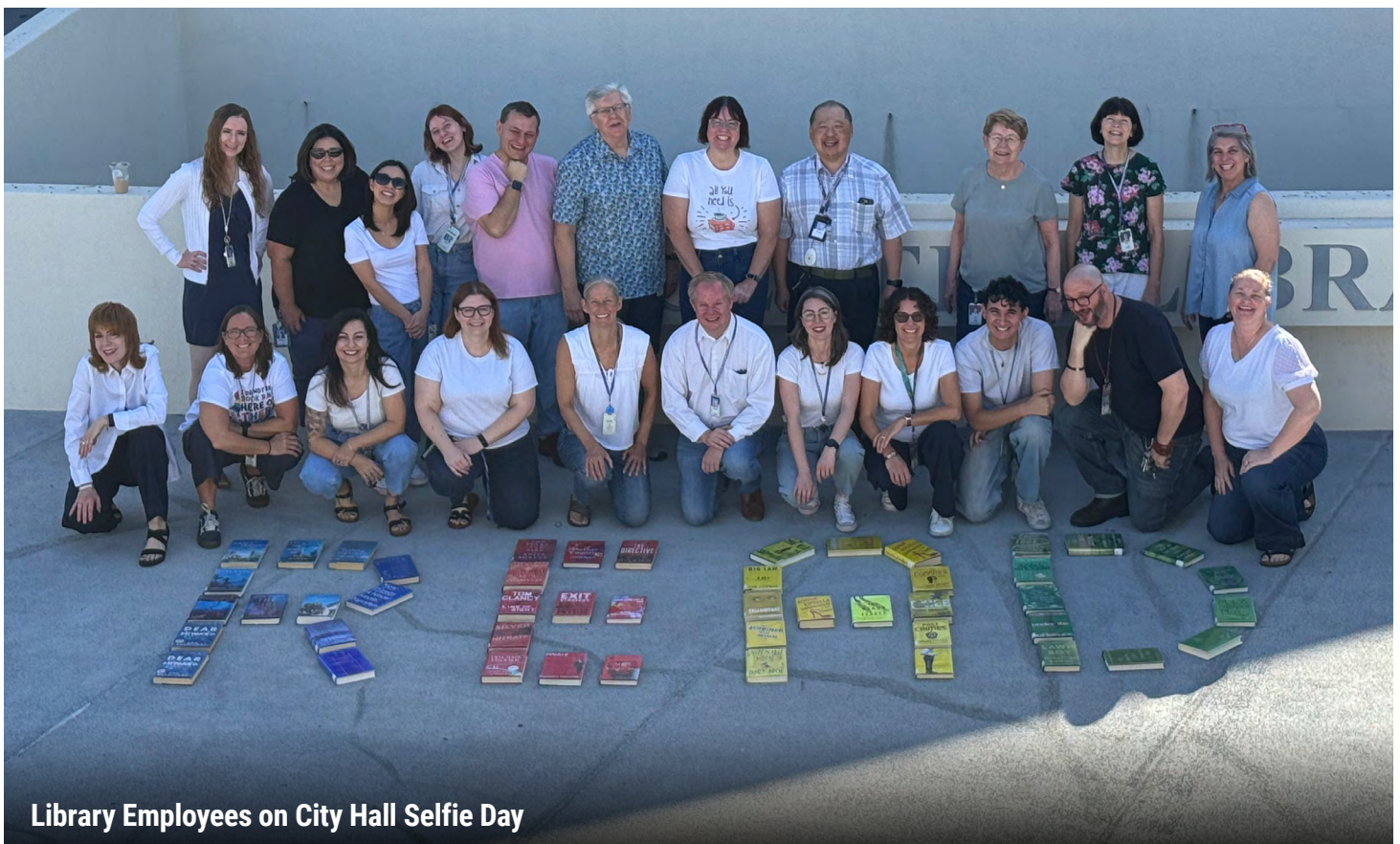
Library Employees on City Hall Selfie Day

Visit the MotivateMe incentive page on myCigna.com for more ways you can earn with your 457 account.