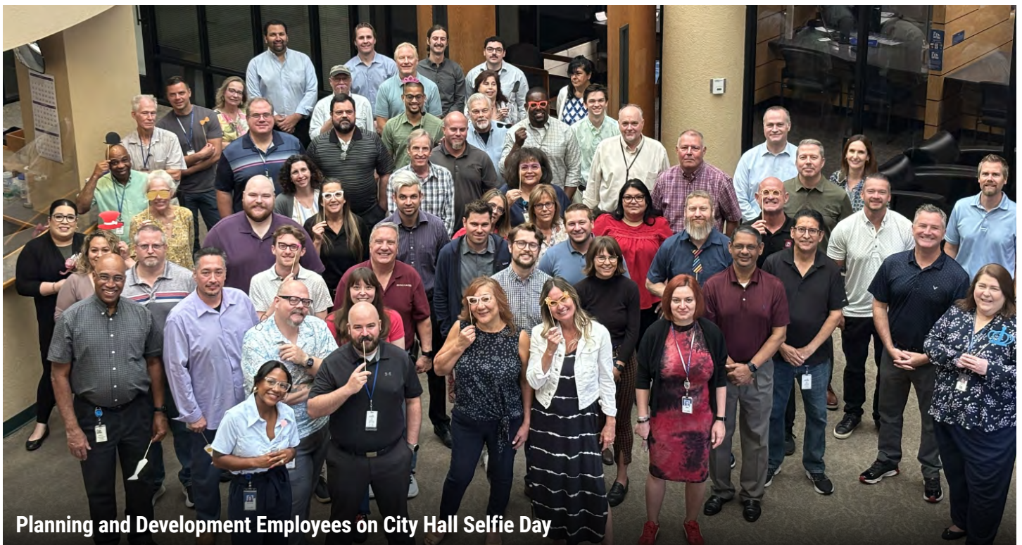
Planning and Development Employees on City Hall Selfie Day