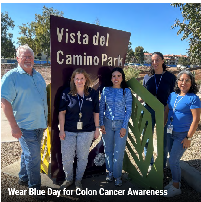
Wear Blue Day for Colon Cancer Awareness