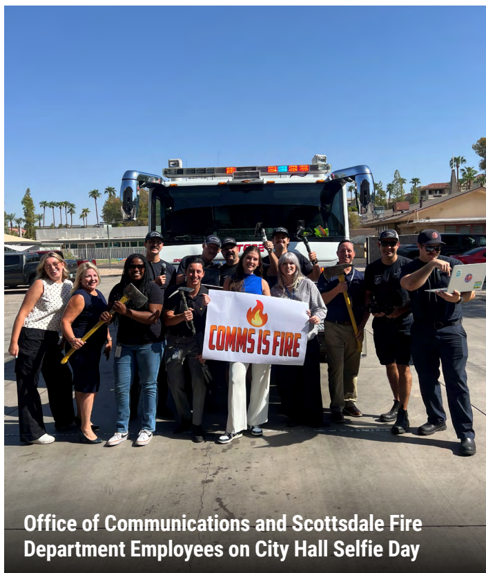
Office of Communications and Scottsdale Fire Department Employees on City Hall Selfie Day

*To determine gross monthly pay, divide gross annual pay by 12.