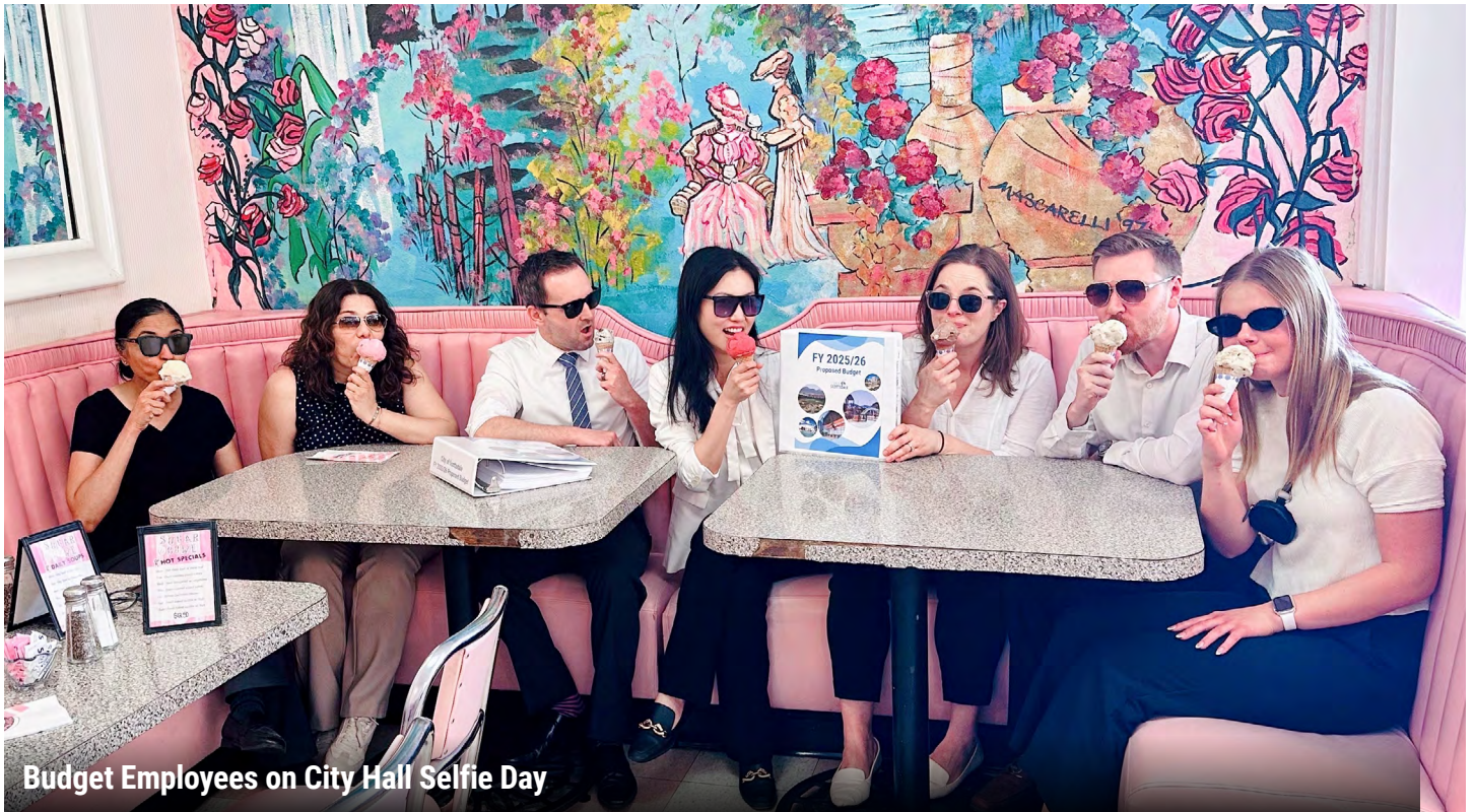
Budget Employees on City Hall Selfie Day

Email us at hrcbenefitsemal@ScottsdaleAZ.gov