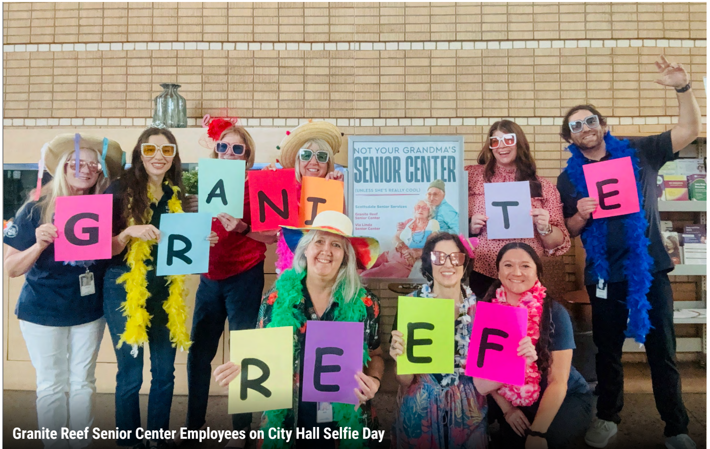
Granite Reef Senior Center Employees on City Hall Selfie Day