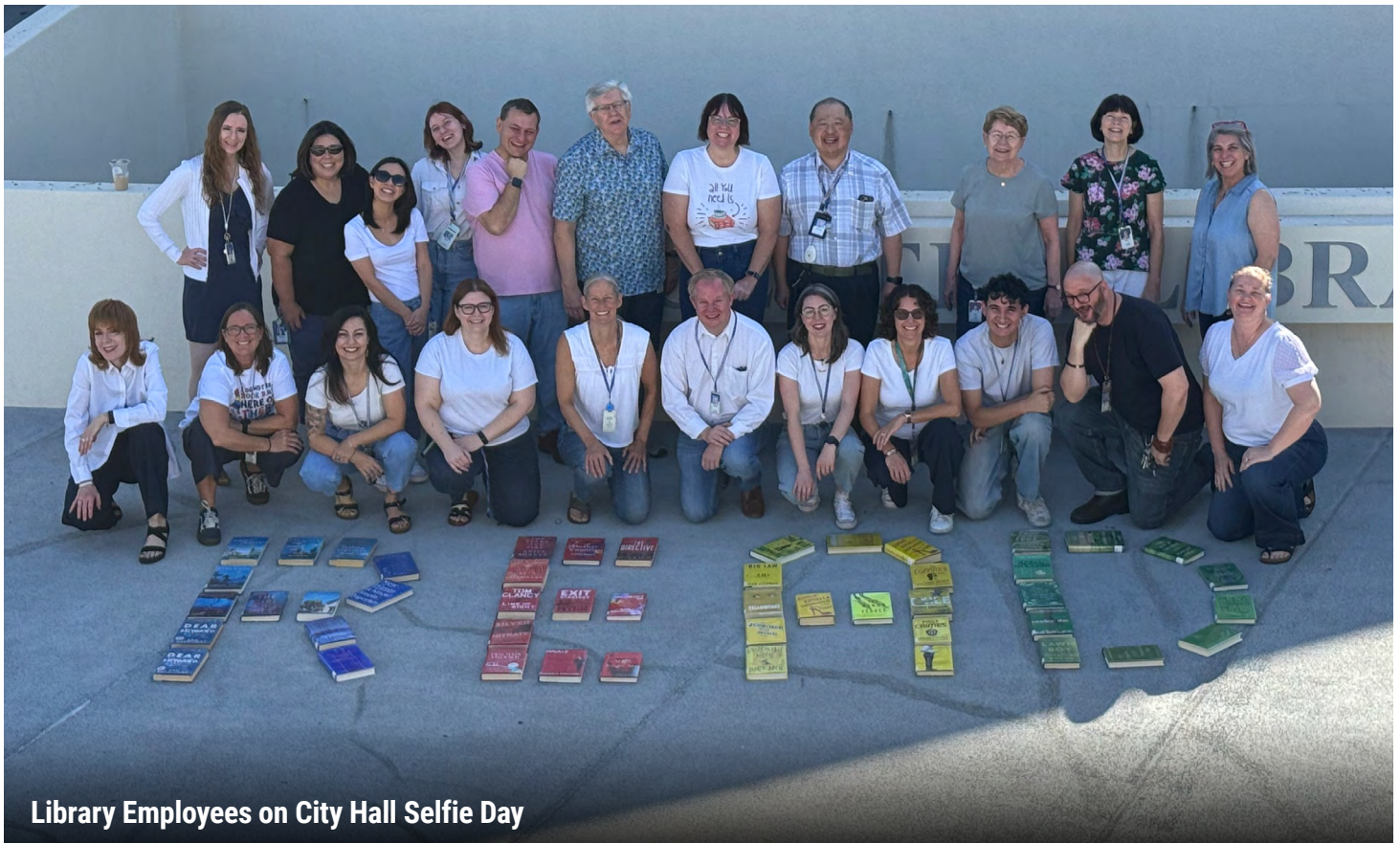
Library Employees on City Hall Selfie Day

Visit the MotivateMe incentive page on myCigna.com for more ways you can earn with your 457 account.