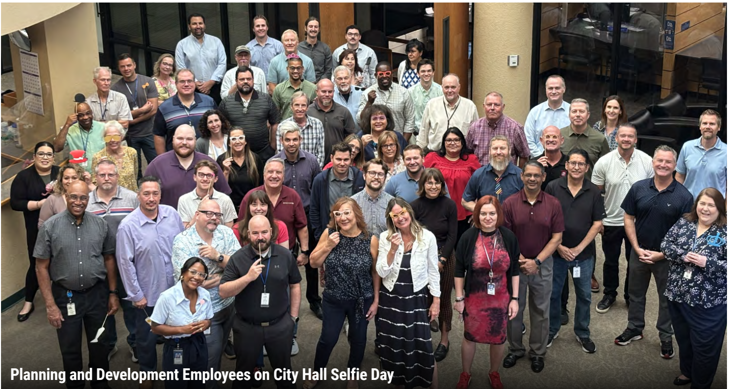
Planning and Development Employees on City Hall Selfie Day