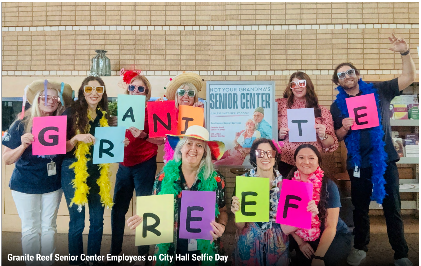
Granite Reef Senior Center Employees on City Hall Selfie Day