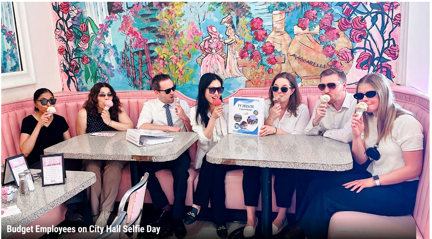
Budget Employees on City Hall Selfie Day

Email us at hrbenefitsemal@ScottsdaleAZ.gov