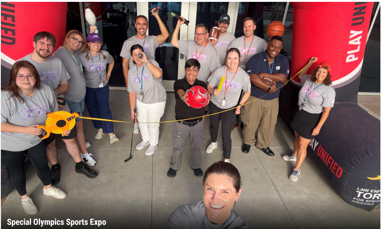
Special Olympics Sports Expo

Note: You must purchase additional life insurance on yourself to be eligible to purchase coverage for your spouse and/or your children. Coverage is subject to the approval of NY Life Insurance. You may apply for new or increased coverage at any time, but you must satisfy NY Life Insurance's insurability requirement.