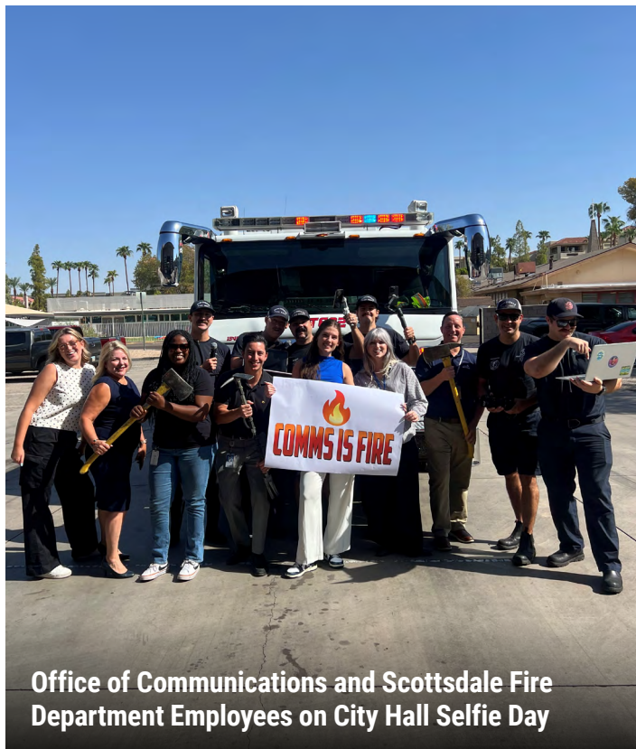
Office of Communications and Scottsdale Fire Department Employees on City Hall Selfie Day

*To determine gross monthly pay, divide gross annual pay by 12.