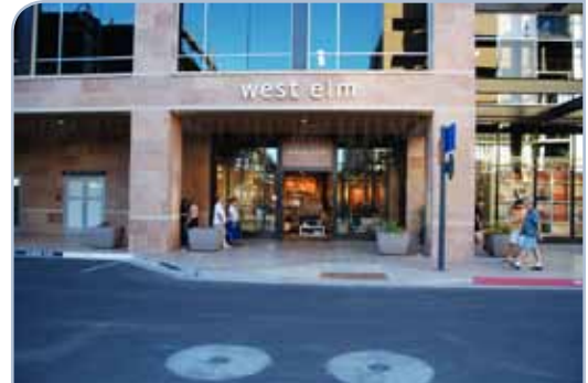
Site design features, such as ground floor retail, provide access to pedestrians, bicyclists, and transit users.

Consider the least impactful solutions to improve street capacity first, by utilizing priorities outlined in the Scottsdale Transportation Master Plan.