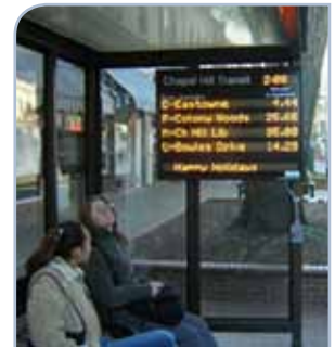
Bus route wait time displays make transit use more convenient and user-friendly.