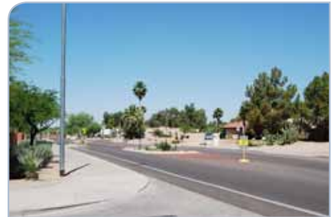
Streets south of the Greater Airpark, such as Thunderbird Road and Sweetwater Drive (pictured), should remain neighborhood-serving.