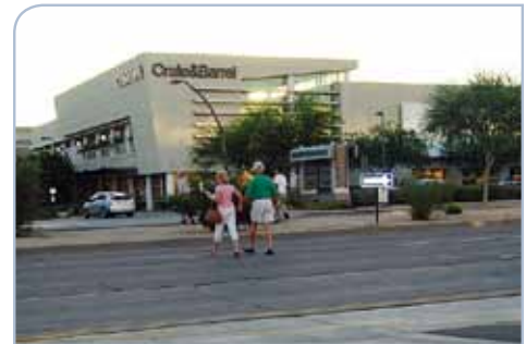
Signals, cross-walks, and/or pedestrian refuges or other crossings are needed for safety and convenience where destinations are bisected by major streets, such as Scottsdale Road, which separates Kierland Commons and Scottsdale Quarter.