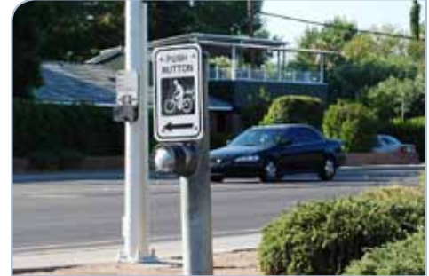
Bicycle facilities, such as bicycle lanes and crossing signals, promote better bicycle access and circulation.