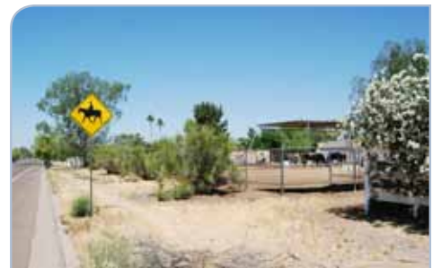
Equestrians are encouraged to utilize the area's non-paved trail system.