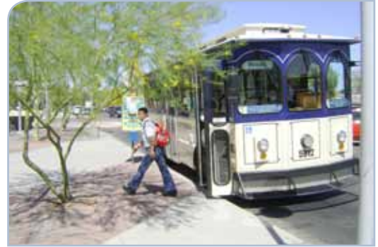
Circulators, like the Scottsdale Trolley (pictured), can help move people around the Greater Airpark efficiently and comfortably.