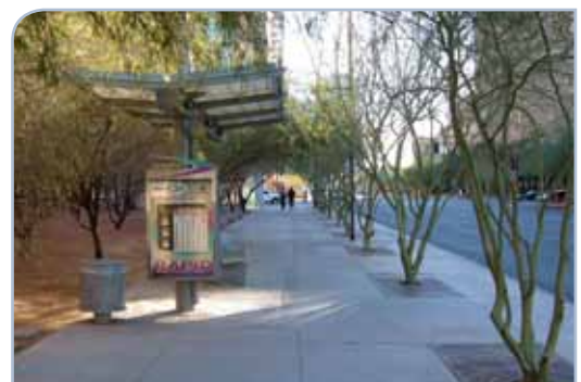
Transit facility designs should provide air circulation and shading.