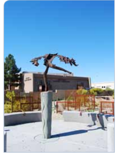
This public art piece, titled 'Icarus Falling,' reflects the Greater Airpark's identity as an aviation-based area and provides seating and sophisticated landscape treatments.

Incorporate wayfinding signage and area branding elements in Gateways.