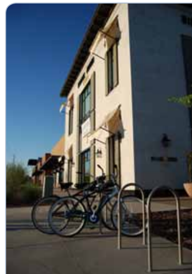
Bicycle access is an important part of mixed-use and proper space should be provided in site designs.