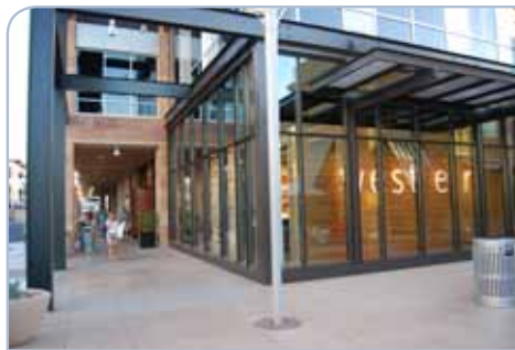
Human-scale development provides visual interest and convenient crossings to pedestrians.

The character of these areas is pedestrian-oriented, urban, and human-scale and features a variety of open spaces, gathering areas, and multi-modal transportation options. Multi-modal transportation should include bicycle and transit access connected to a pedestrian network to encourage social contact and interaction among the community. Design elements should be oriented toward people, such as the provision of shelter and shade for the pedestrian, active land uses at the ground floor/ street level, and a variety of building forms and facade articulation to visually shorten long distances. A variety of textures and natural materials is encouraged to provide visual interest and richness, particularly at the pedestrian level. Design of this Future Land Use Area should be based on a small city block layout with mid-block connections to promote greater walkability. The public realm may be activated through building and site design, orientation toward the street, high-activity uses on the street level, and the integration of public art.