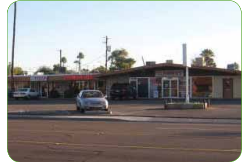
Underdeveloped strip center opportunity.

Support the development of viable, smaller-scale grocery stores that can provide the variety, quality, and price of supermarkets while relying on a smaller customer base and floor space.