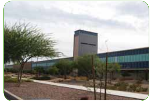
Major employer: General Dynamics.