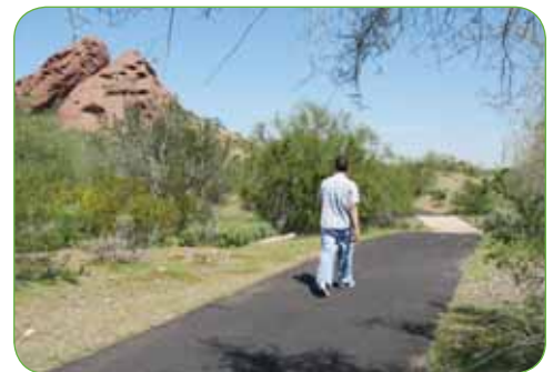
Papago Park multi-purpose trail.

Encourage the cities of Phoenix, Scottsdale, and Tempe and the Salt River Pima-Maricopa Indian Community to enter into an intergovernmental agreement to approve and implement the Papago Park Master Plan.