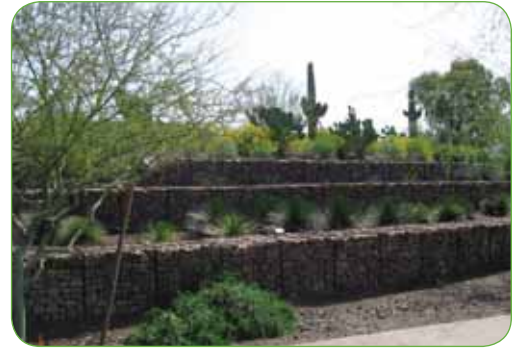
Low-water use plant materials along a public trail.