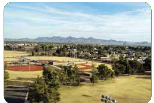
Recreational facilities within Indian Bend Wash.

Encourage public and private investments to improve, enhance, and upgrade existing open spaces and indoor and outdoor recreational facilities throughout Indian Bend Wash to continuously offer quality recreational opportunities to the community.