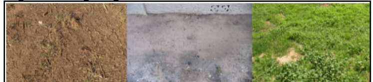
Figure 2: Ineligible grass

The first image is a grass at less than 50% density. The second image is of a designated grass area that is bare dirt. The last image is over 50% weeds.